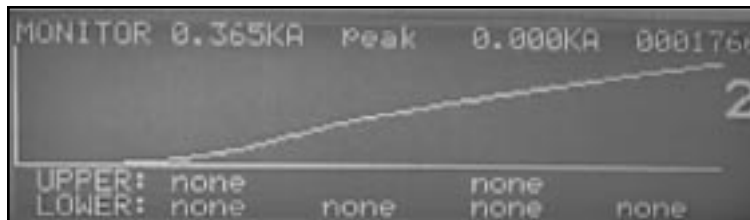
Figure 2: Monitored Current Graph

The current limit can now be established. Program the upper current limit to the level that it reaches in about 3-4 milliseconds. This level should be lower than the current level required to stick the parts together. Press the COOL button to program the action for reaching the current limit. Choose “4. APC: STOP PULSE 1/ALLOW PULSE 2” (See Figure 3).