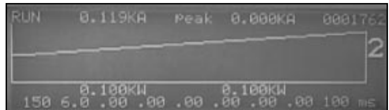
Figure 1: Initial Power Pulse

If the initial power level for the first pulse is not known, start with a very low setting of 0.100 KW. Use 150 milliseconds of squeeze time and 100 milliseconds of hold time. Do not program weld time or downslope. Program the second pulse for 0 milliseconds (See Figure 1).