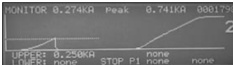
Figure 4: First Pulse Terminates When Current is Reached

Fire the pulse through several sets of parts. The pulse should terminate in about 3-4 milliseconds for all parts. The resistance graph should show the resistance decreasing to a consistently