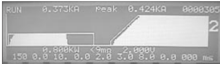
Figure 3: First Pulse Terminates when Current Limit is Reached

When programming the second pulse, an upslope may still be required to avoid weld splash. Constant current should be used for welding flat parts, and constant voltage should be used for welding wires or other round parts.