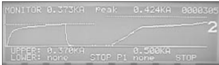
Figure 2: Dual Pulse Weld with First Pulse Current Limit

power level should be decreased. If the current does not rise sufficiently, the power level should be increased.